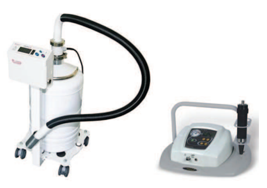
Fig. 1. Examples of stationary and portable cryotherapy apparatus

In some cases, excessive hyperaemia may worsen pain in the long-term (with a strong inflammatory component). In this case cold therapy instead of cryotherapy is recommended.