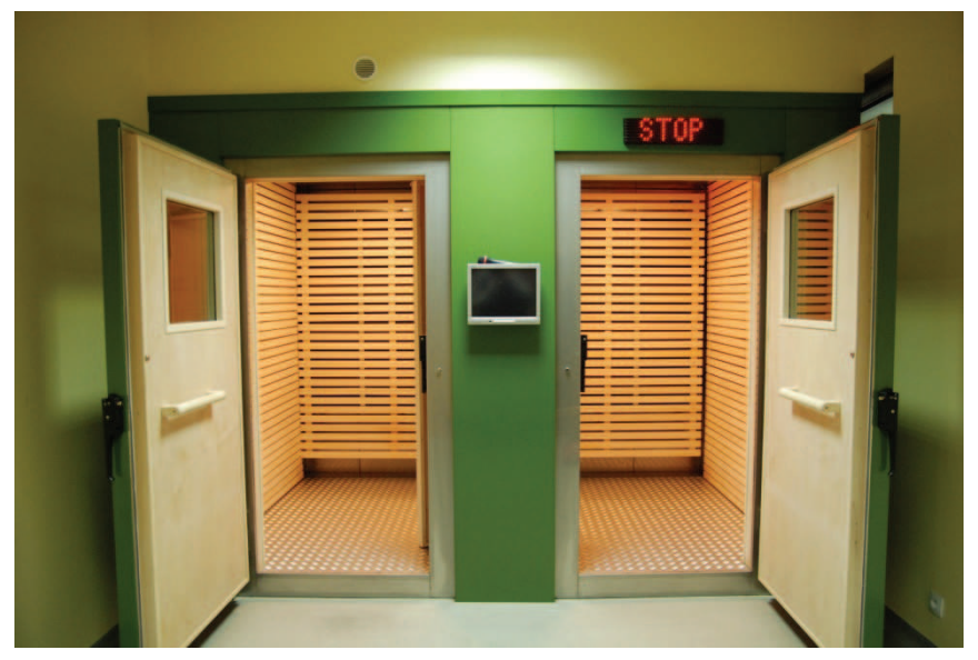
Fig. 4. Two stage cryochamber (KRIOSYSTEM Sp. z o.o. Poland)