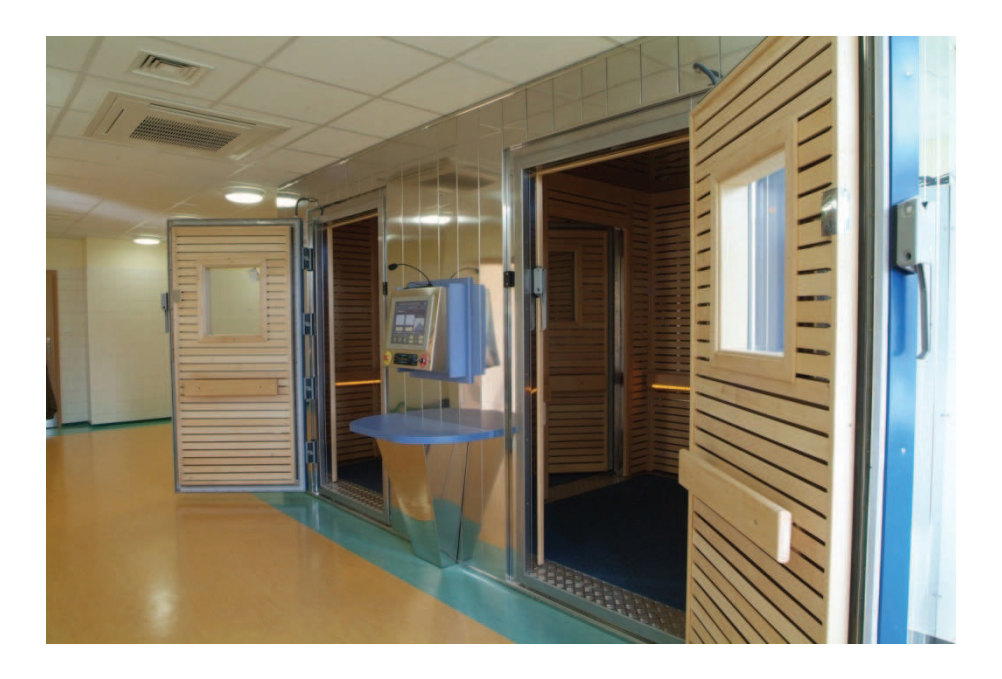
Fig. 3. Two stage cryochamber (CREATOR Sp. z o.o., Poland)